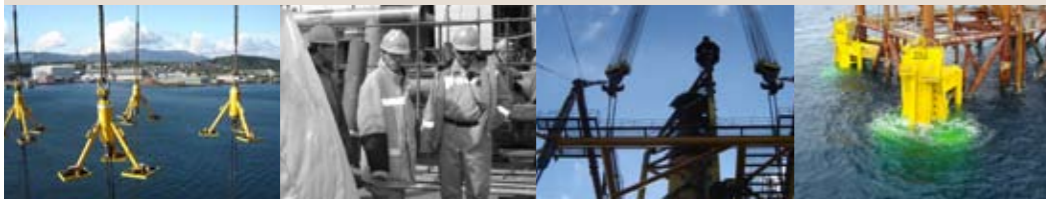
'The removal of structures, jackets and pipe lines is a new market which is growing as well'

Other customers require custom-made tools, as demonstrated in our most challenging removal project to date. This involved the removal of a complete jacket structure using buoyancy tanks. IHC's expertise in this project comprised the connection of buoyancy tanks to the jacket structure using external hydraulic grippers in combination with hydraulic pull-in systems. After connection of the buoyancy tanks and pumping out the water the jacket foundation piles were cut and the whole structure was floating again, ready for towage to a scrap yard.